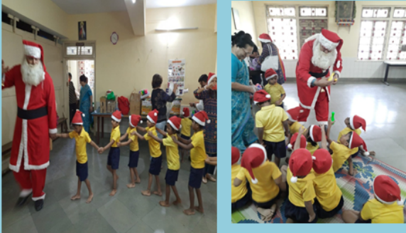
Santaclaus is no stranger to them