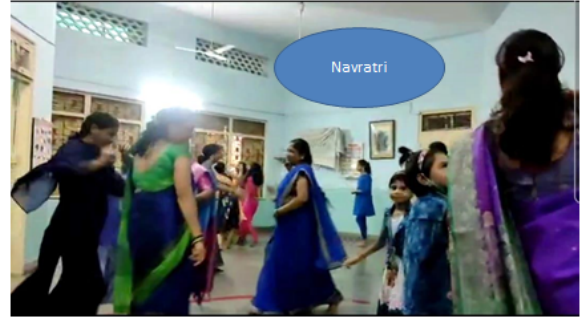
Festivals in the Centre